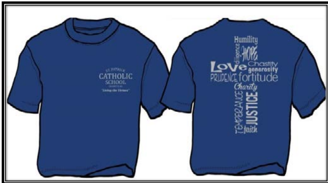
Slate Blue Tshirt / Gray Font "Living the Virtues"